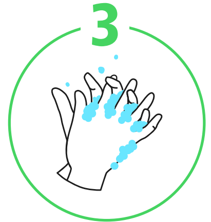
In between the fingers