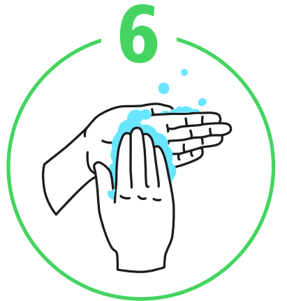
The tips of the fingers

Use a tissue to turn off the tap. Dry hands thoroughly.