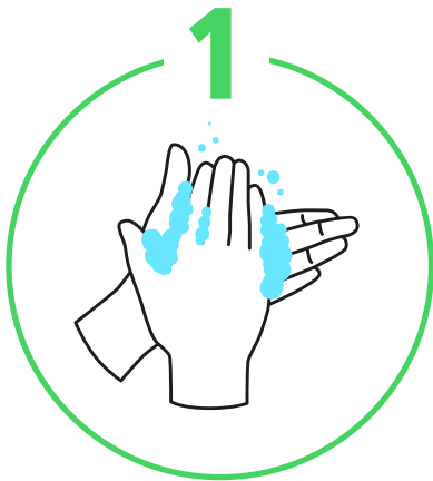
Palm to palm

Wash your hands with soap and water more often for 20 seconds