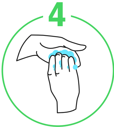
The back of the fingers