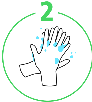
The backs of hands